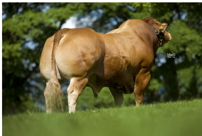
Dolcorsllwyn Fabio (UK)