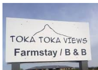
Tokatoka Views Farm Stay