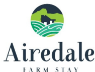
Airdale Farm Stay

We would like to make a special mention to the following local B&B’S for accommodating our equestrian judges.