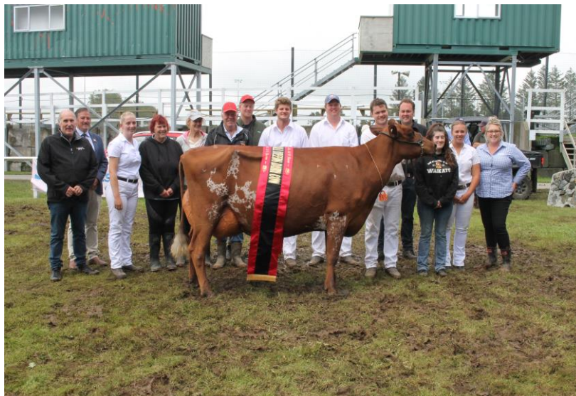
RAS NZ Champion All Breeds Dairy Cow – Stratford A&P Show 2020 Royal Event Dairy 'Pukekaraka Elle Delila' exhibited by Gilbert Family

Dairy Section - Schedule including Ayrshire New Zealand - North Island Title