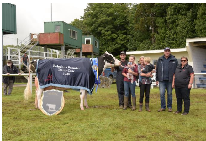
Beledene Premier Dairy Cow – A&P Show 2020 Te Hau Windbrook Cleo- shown by Te Hau Holsteins

131 Cow – 4 year old In Milk PM: $675, 405, 135, 80, 55