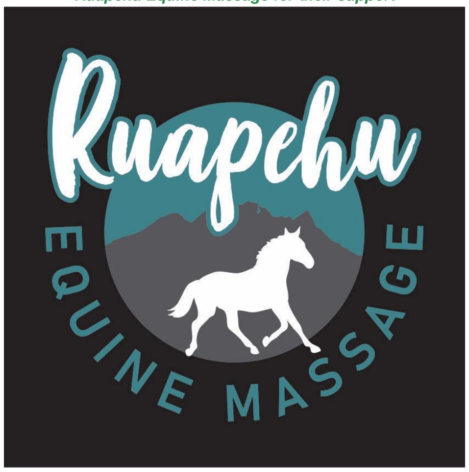
Masterton A&P Showing Championships thank Ruapehu Equine Massage for their support