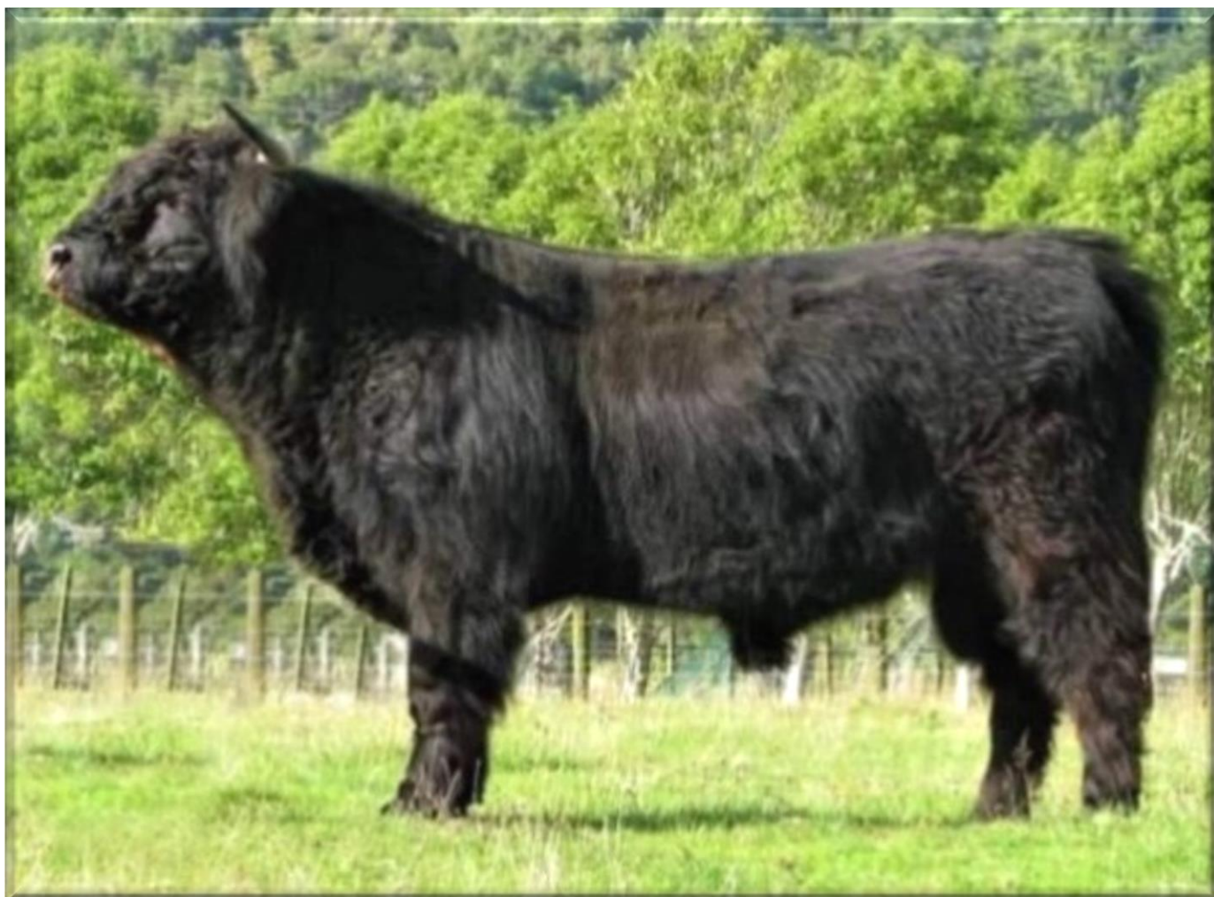
Loki Woollymoo of Te Mere – Supreme Beef Exhibit Horowhenua AP&I Show 2022