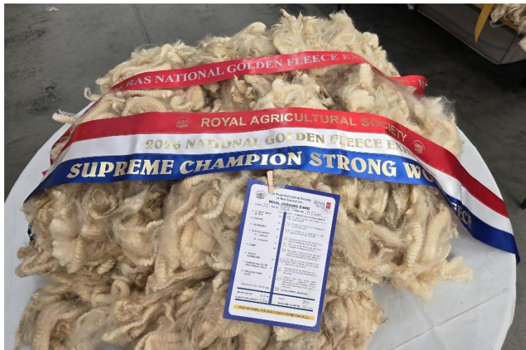
Champion Perendale Fleece